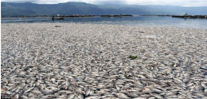
Steel Factory pollution kills fish