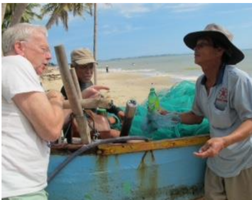
CEO talks with fishermen

Irish School of Ecumenics/Loyala Institute Building, Trinity College Dublin